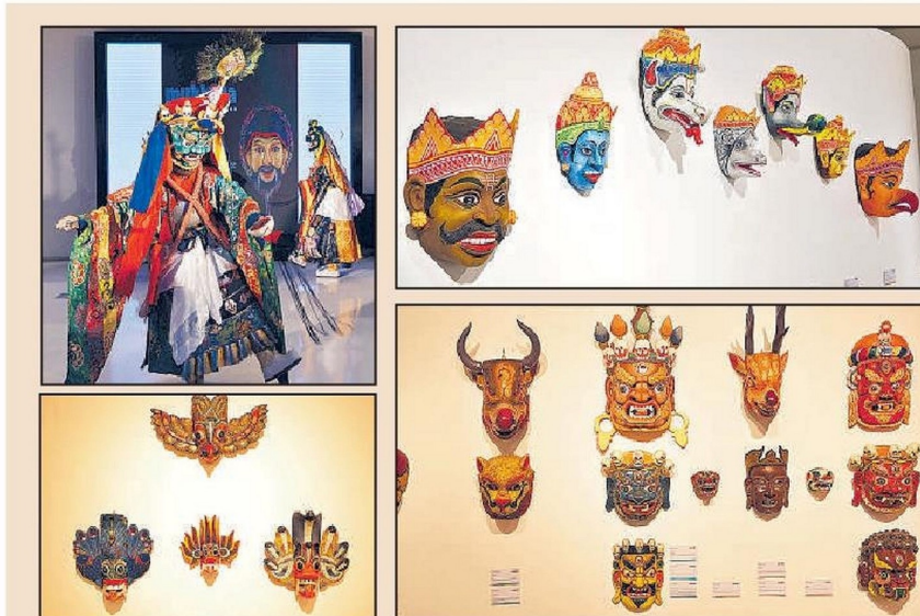
Glimpses from the exhibition